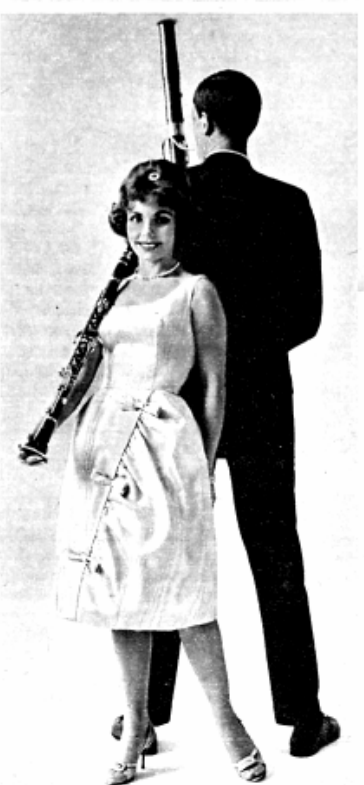
Parade + Jan. 29, 1961